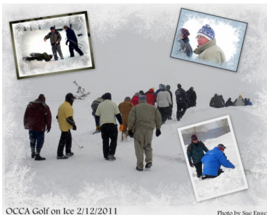
OCCA Golf on Ice 2/12/2011

organization that brings people with developmental disabilities and unpaid citizen volunteers together for lifelong friendship. For each matches, we find a local volunteer, called "Advocate", whom we introduce to a person with developmental disabilities, called "Partner", and then we provide ongoing support to their relationship. Over those years, we created and supported nearly 100 such matches. Many lasted for years. At present we have over 20 active matches, some old, some more recent.